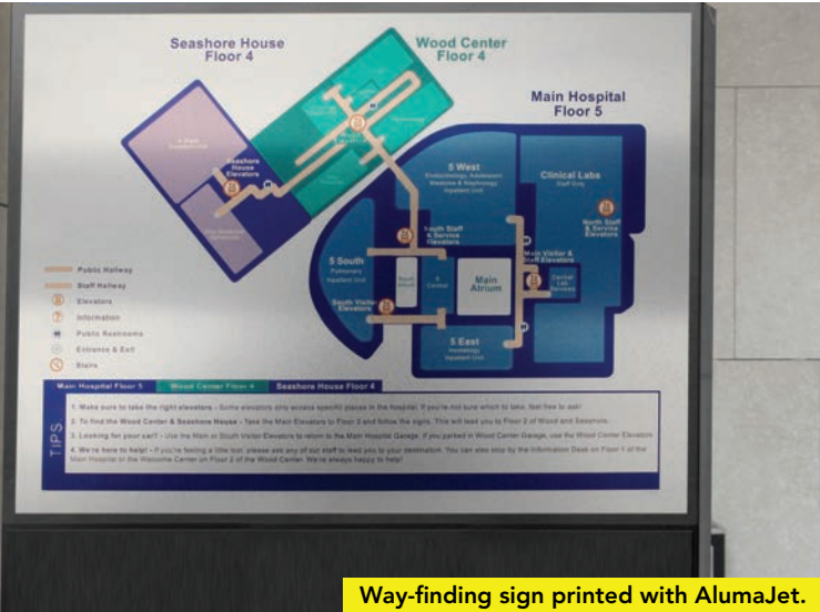
Way-finding sign printed with AlumaJet.

According to Better Life Technology, the display required