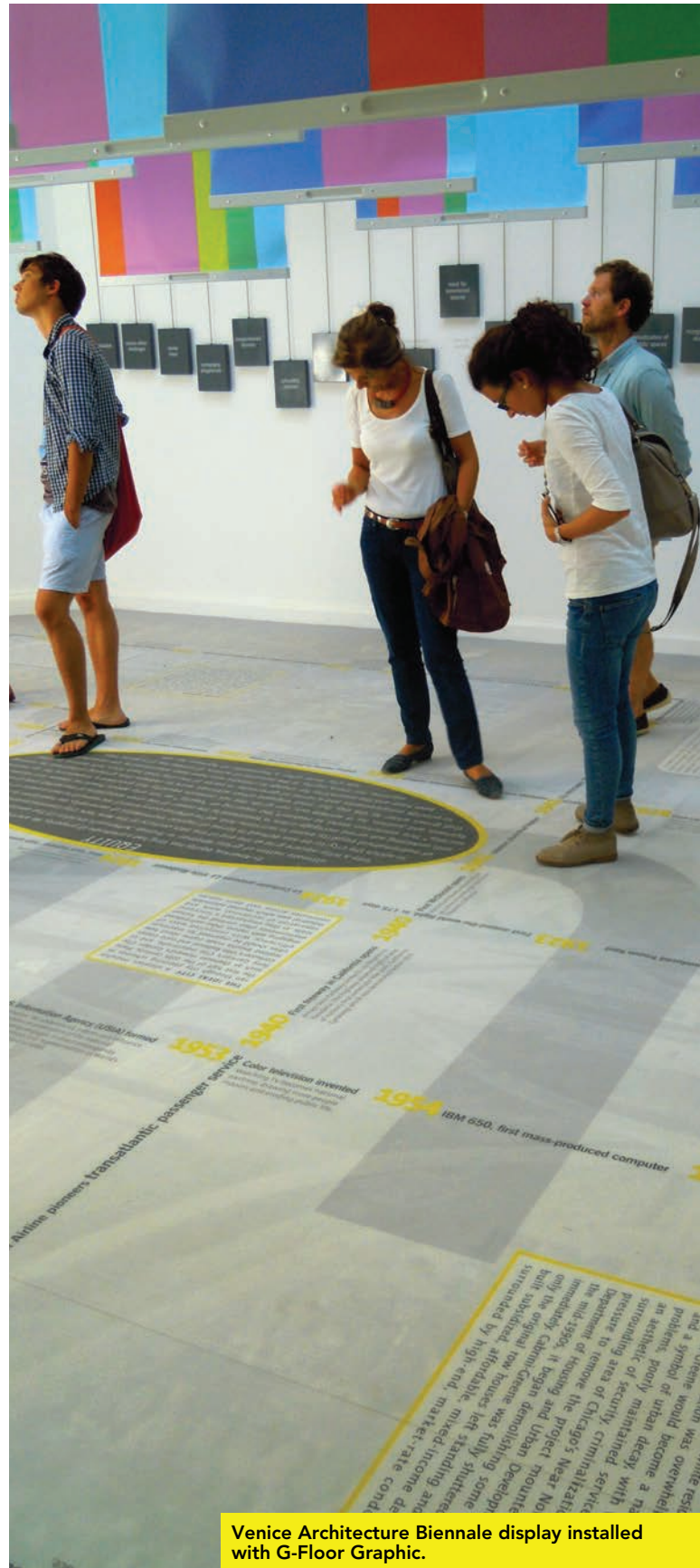
Venice Architecture Biennale display installed with G-Floor Graphic.